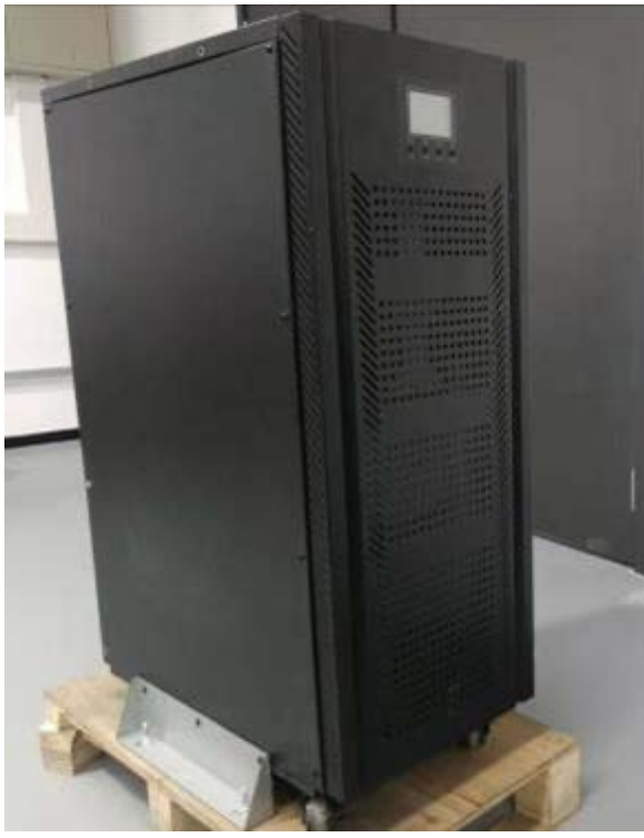
The front of the sample