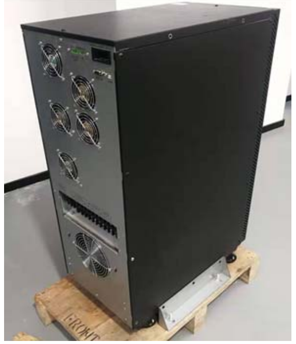
The back of the sample --End of test report--